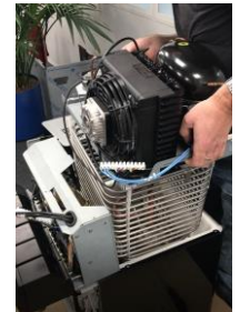
Removable refrigeration deck system