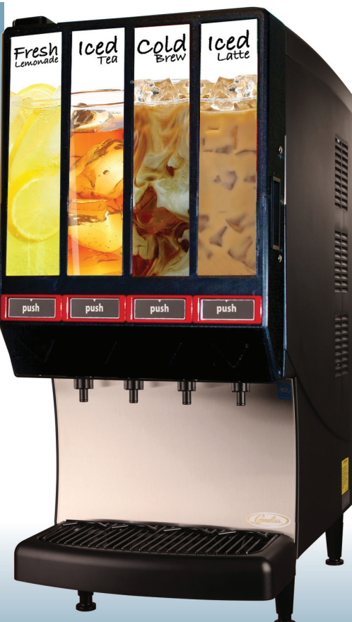
Single-Panel Merchandiser Unit Includes juice graphic!